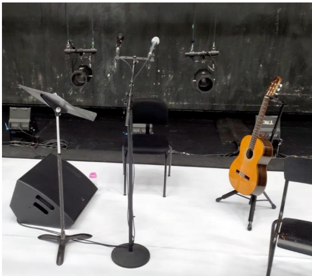
Vocal and Guitar