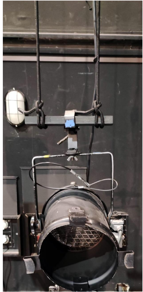
Individual parcan rigged onto the "swing" provided by the company