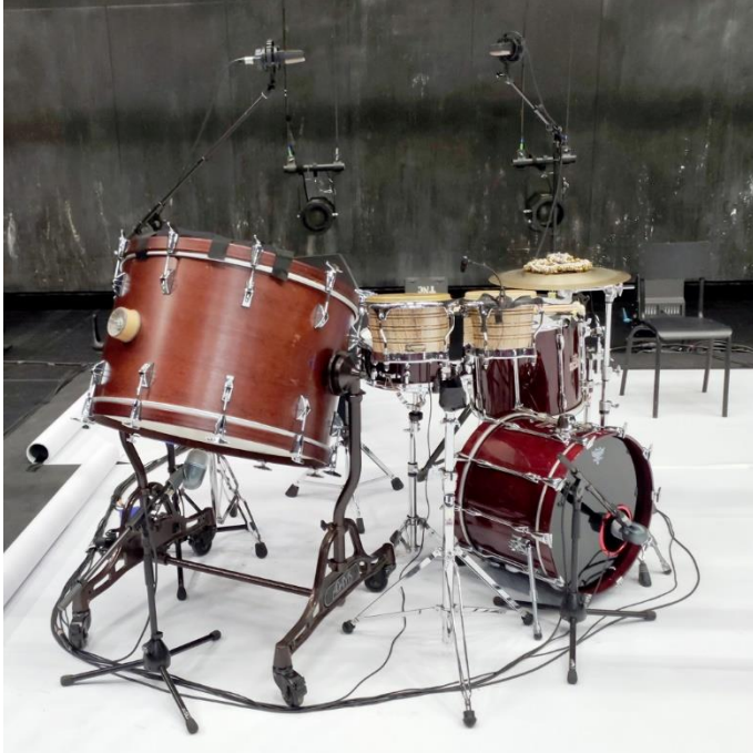
Drum and Percussion Set

The company provides a clavichord (size of the travel case: 114 x 38 x 22 cm; weight: 19kg), a flamenco guitar and small percussions (Cymbal, bells...). Extra luggage costs might apply for the travel of the three musicians by plane (from Sevilla, Spain).