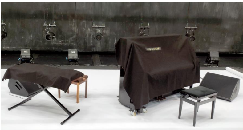
Clavichord and Piano