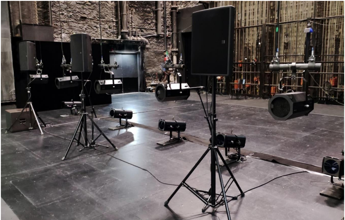
Lights and sound side setup